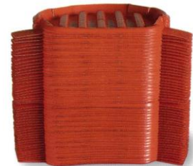
25 standard bases nest for shipment and storage

Economical and easy to use - simply place the base on the ground, add a sand bag and snap-lock the drum top to the base. Made of durable, impact resistant polyethylene.