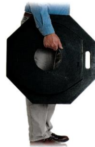
Worker using center carrying bole with 40-lb. base

TrafFix 100% recycled rubber base is the "sandless" way to ballast channelizer drums. The rubber base "grips the road" and minimizes drum movement due to wind gusts. Rubber bases come in 40 and 25 pound weights with two convenient carrying methods.