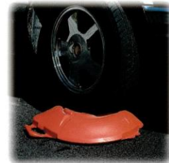
Automobile running over a San-Fil base

San-Fil bases are designed to hold approximately 50 pounds of sand. The twist lock cover keeps the sand inside the base. Two carrying handles make movement and placement an easy job. The low profile 4" high base easily clears vehicle undercarriages and can even support the weight of any vehicle.